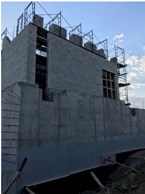
Terminal North Stair Tower