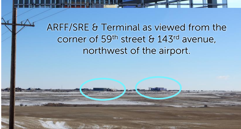
ARFF/SRE & Terminal as viewed from the corner of 59 th street & 143 rd avenue, northwest of the airport.